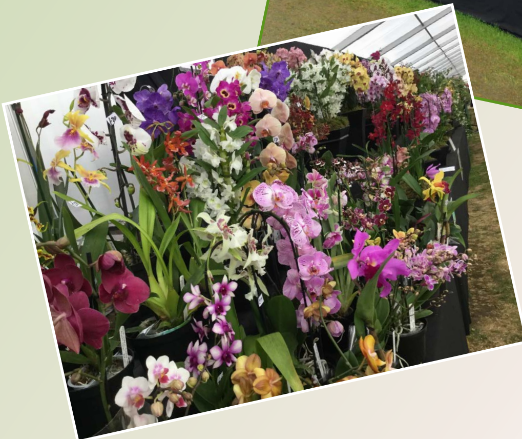
A different angle - showing details of the colourful orchids he always includes in his displays